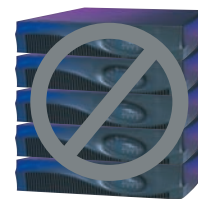
Multiple Rack UPSs

You can start with the Liebert NX rated 10kVA, 15 kVA, 20 kVA or 30 kVA. The 20 kVA and 30 kVA UPSs can be paralleled to 60 kVA or 90 kVA respectively. If you already know you will need more capacity, you can start with the Liebert NX UPS with Softscale, which can provide support starting at 40 kVA and grow to 360 kVA with paralleling.