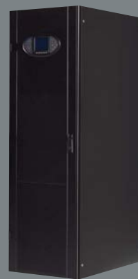
Liebert NX with Softscale technology

For more information on data center power solutions, contact your local Liebert Network Solutions Partner.