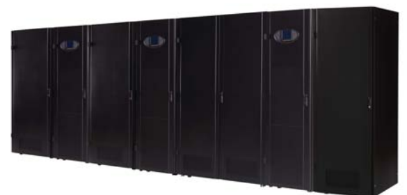
Liebert NX Paralleled System

Consider how a software-scalable Liebert NX creates the foundation for a growing data center. Start with a 40 kVA module to meet current needs, then grow capacity to 80 kVA through Softscale™ technology. Then, an additional 40kVA module can be paralleled with the original 80 kVA module for a total capacity of 120kVA. With Softscale technology the 40kVA module's capacity can be increased to 80kVA for a total combined capacity of 160kVA. So your customer has quadrupled power capacity by adding a single UPS module!